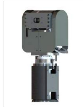
伺服回转+翻转 (BC轴) Servo rotation + flip (BC axis)