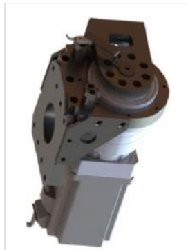
C轴 C axis