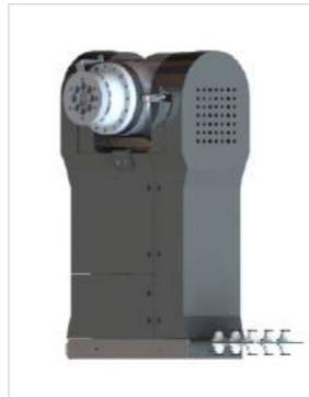
伺服回转+翻转 (AC轴) Servo rotation + flip (AC axis)