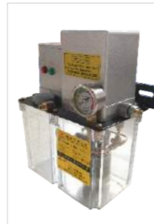
电动油脂润滑泵 Electric lubricating pump