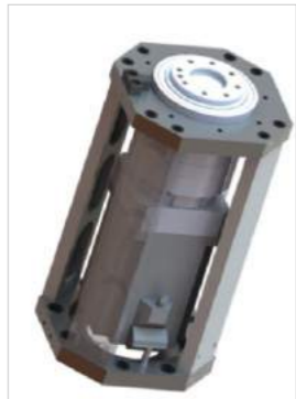
B轴 B axis