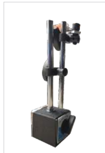
中板检查 Middle plate sensor