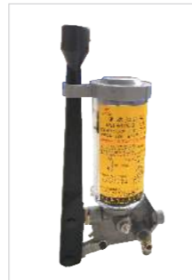
手动油脂润滑泵 Manual lubricating pump